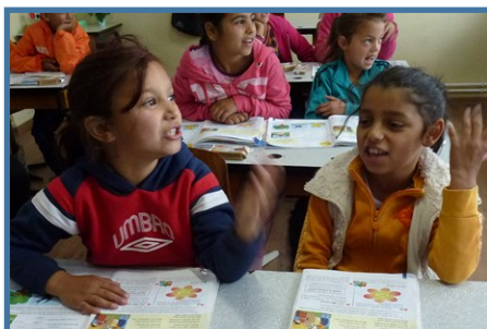
Speaking in Korturare (a Romanian Romani dialect) to learn Romanian in Tinca village, Romania