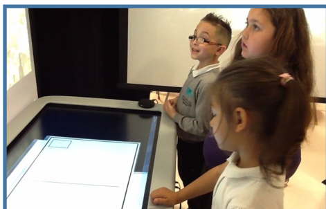
Pupils listening to a cartoon character speaking in English and a translanguage version of East Slovak Romani/Slovak. The translation and recording was done by a Roma parent from Slovak Republic.