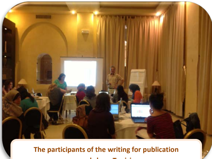
The participants of the writing for publication workshop, Tunisia