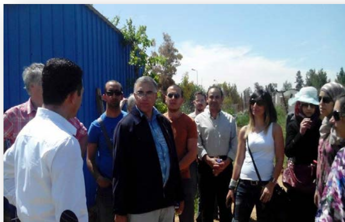
Field visit to the waste water treatment at JUST