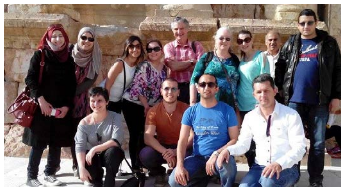
The participants in the historic Jarash city