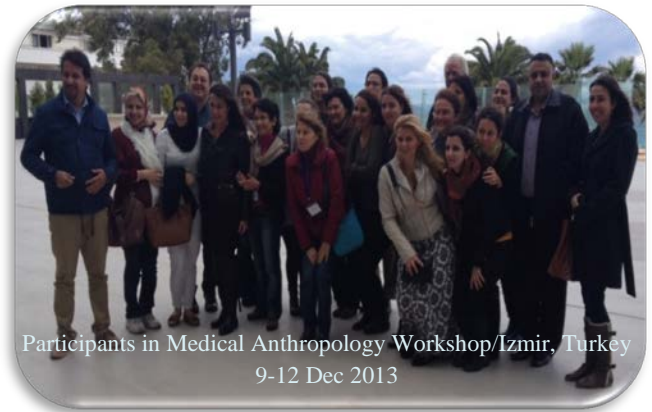
Participants in Medical Anthropology Workshop/Izmir, Turkey 9-12 Dec 2013

The workshop was attended by 23 participants from Turkey, Palestine, Jordan, Syria, Tunisia and Lebanon.