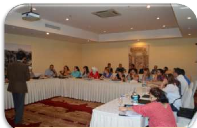
Health Policy Evaluation Workshop Amman, Jordan 3-6 June 2013

During the workshop, trainers discussed the national health policy analysis framework and presented country specific cases of health policy situation from selected Eastern Mediterranean countries. National health administrators shared their experience of implementing public health and healthcare policies.