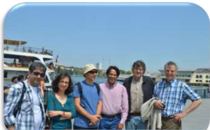
A small group of participants at the first RESCAP-MED international symposium in Istanbul enjoying the Bosphorus