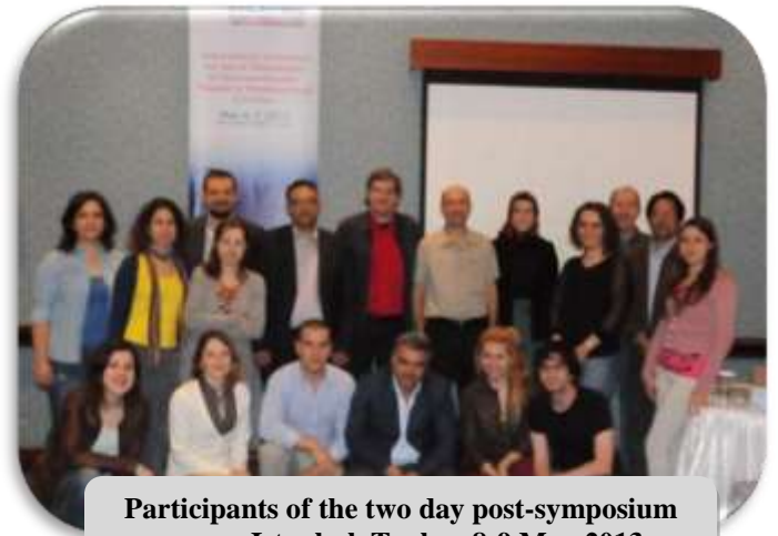
Participants of the two day post-symposium course Istanbul, Turkey 8-9 May 2013

Eighteen participants from five countries with a wide range of backgrounds were enrolled on the course.