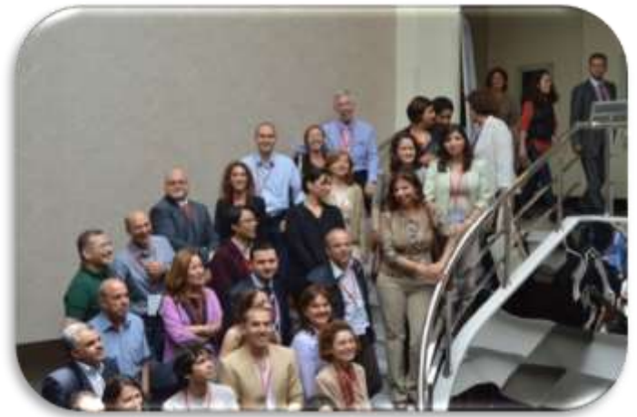
Participants of the first RESCAP-MED international symposium Istanbul, Turkey 6-7 May 2013

The 1 st RESCAP-MED International Symposium on Social determinants of non-communicable diseases in Mediterranean countries was held in Istanbul, Turkey 6-7 May 2013. A total of 96 researchers attended the symposium. The symposium aimed to share knowledge on the global status of inequalities in health and how inequalities affect different population groups; how to measure those differences, and how this knowledge may help to identify and promote effective policies and institutional changes to reduce health inequalities derived from these social factors.