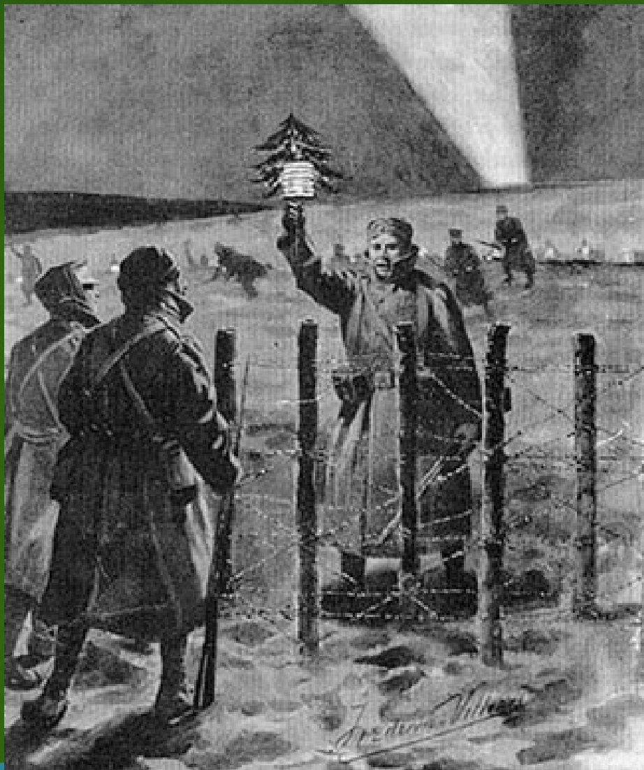
Artist's impression of beginning of truces, London Illustrated News , 9 January 1915.

Quoted from http://www.lewrockwell.com/1970/01/mark-twain/the-war-prayer/