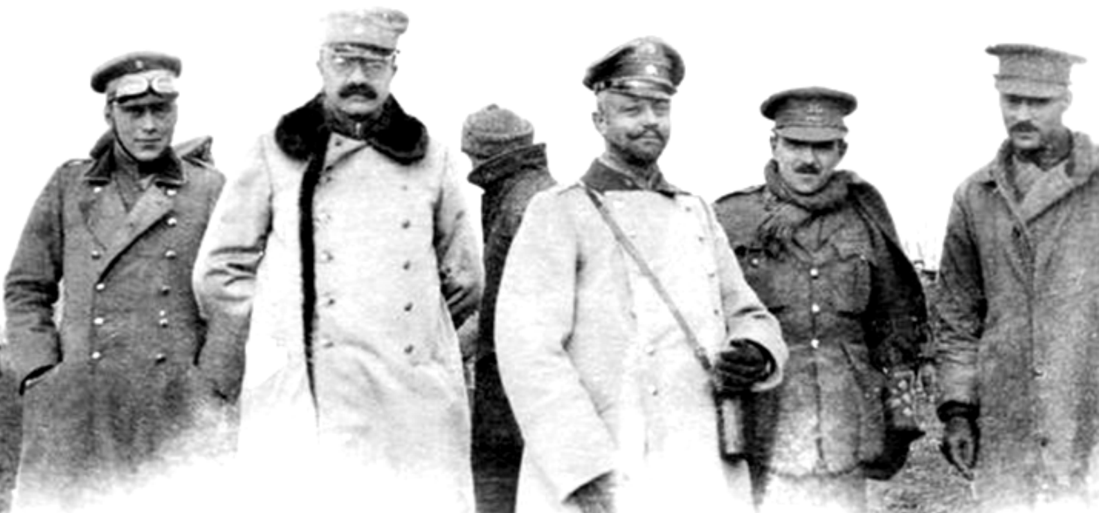
This picture shows British and German soldiers celebrating Christmas Day together in 'no man's land' between the trenches, December 1914.