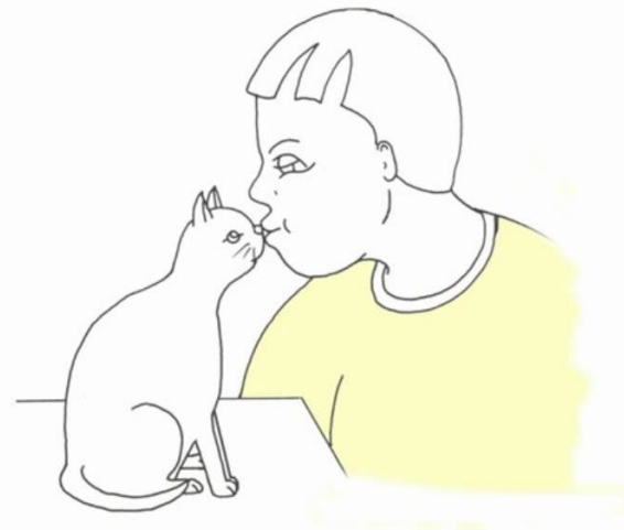
Fuwa beliy-reh mya dher