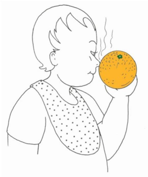
Baccha komla hoongher