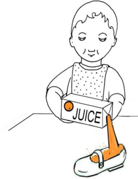
Baccha juice zoothar bithreh dalair