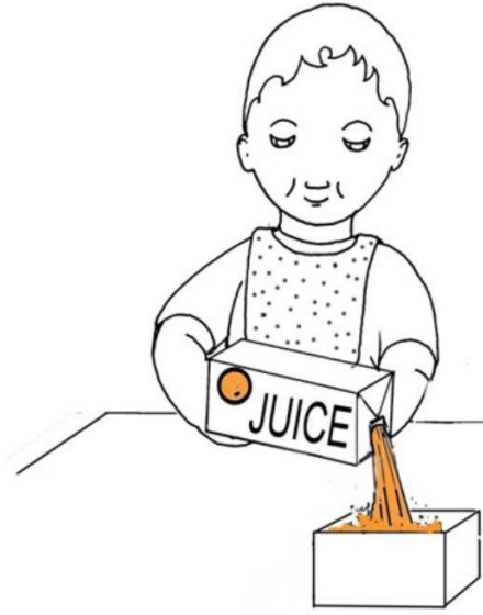
Baccha juice bakshor bithreh dalair