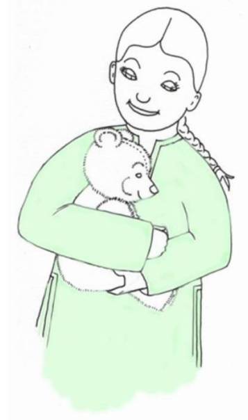
Furi teddy-reh anja khoriya dhorer