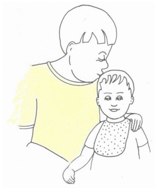
Fuwa baby-reh mya dher