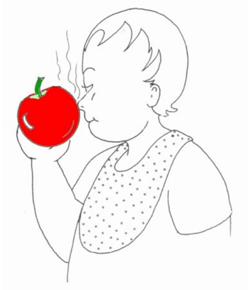
The baby is smelling an apple