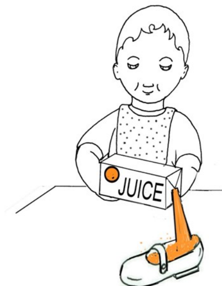
The baby is pouring juice into a shoe