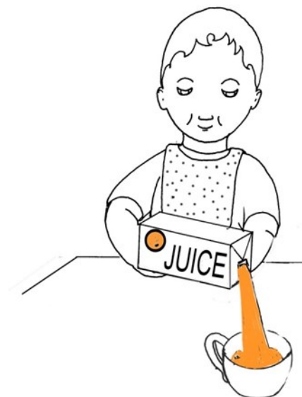
The baby is pouring juice into a cup