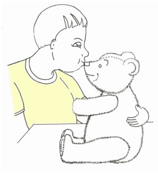
The boy is kissing a teddy