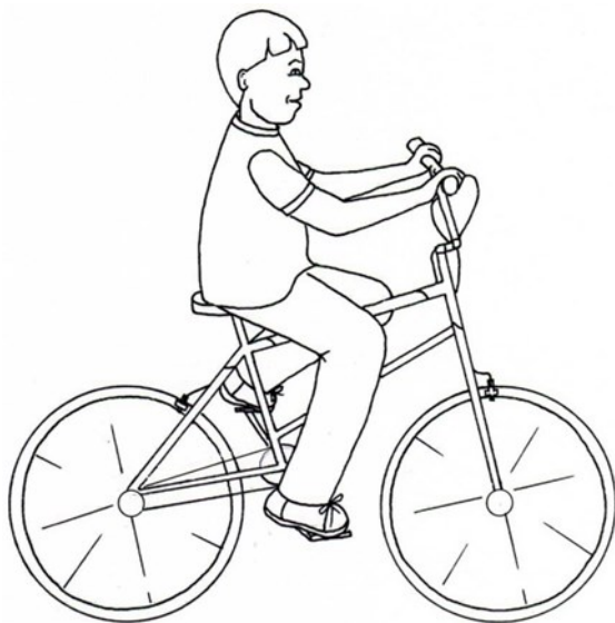
The boy is riding a bike