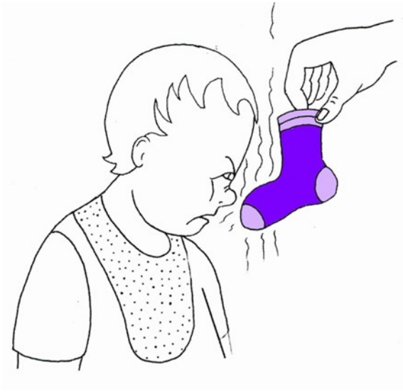
The baby is smelling a sock