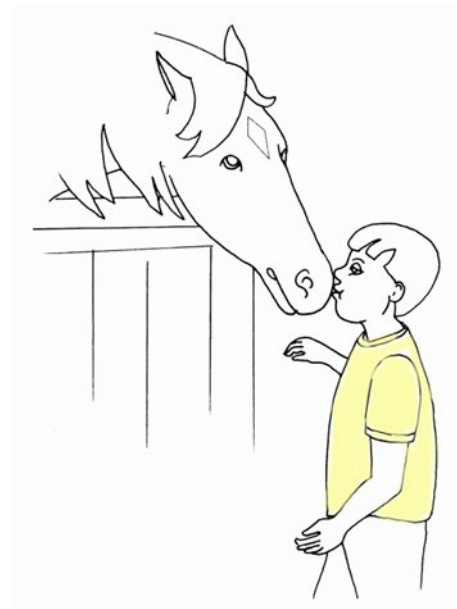
The boy is kissing a horse