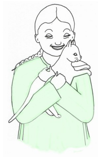
The girl is hugging a cat