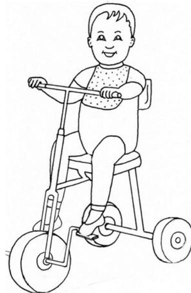
The baby is riding a bike