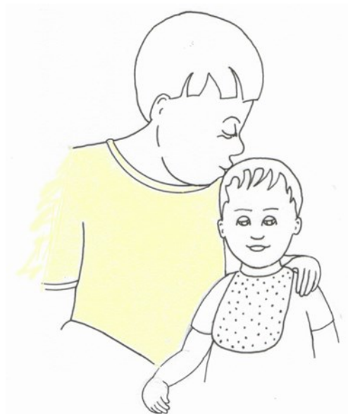
The boy is kissing a baby