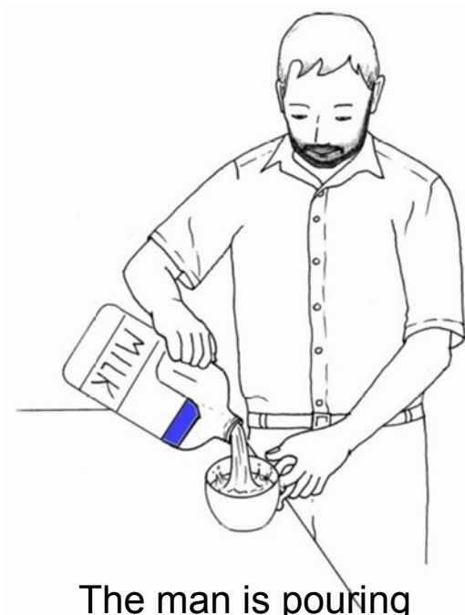
The man is pouring milk into a cup