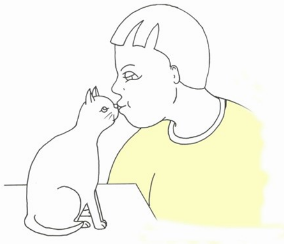
The boy is kissing a cat