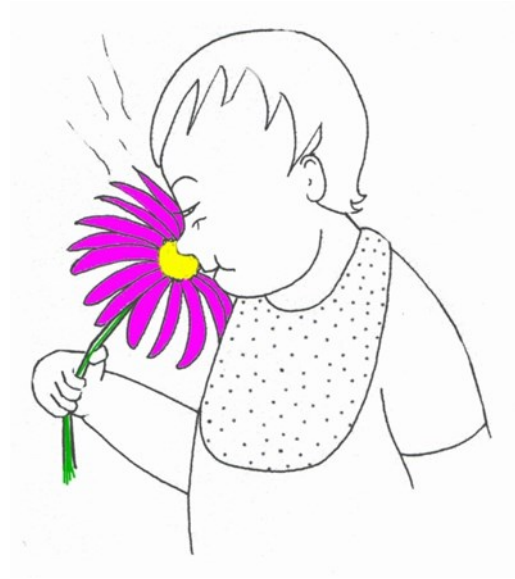
The baby is smelling a flower