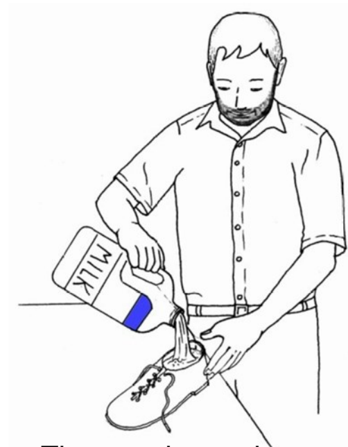
The man is pouring milk into a shoe