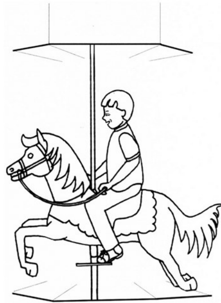
The boy is riding a horse