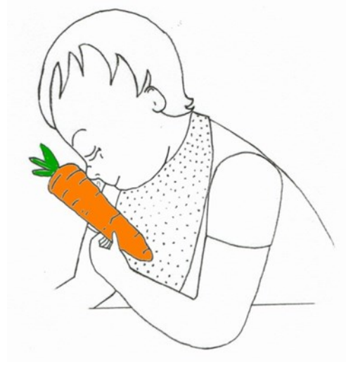
The baby is smelling a carrot