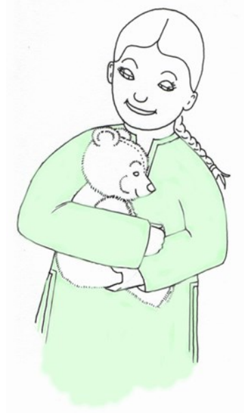
The girl is hugging a teddy