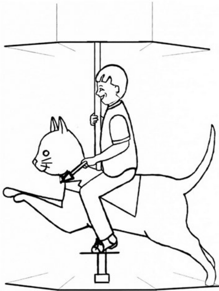
The boy is riding a cat