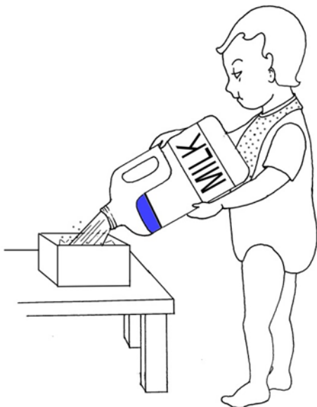
The baby is pouring milk into a box