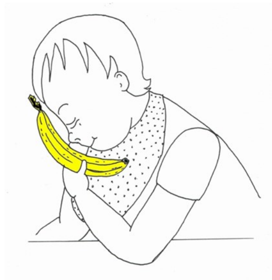
The baby is smelling a banana