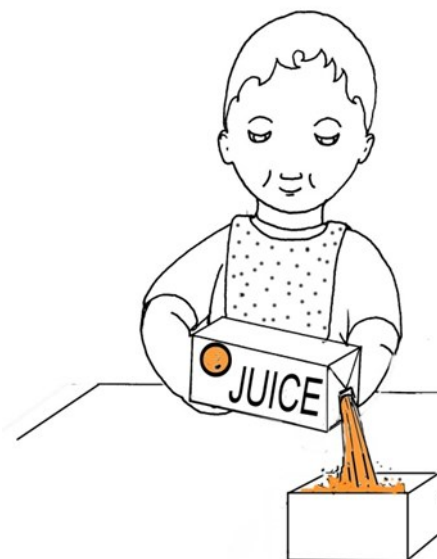
The baby is pouring juice into a box