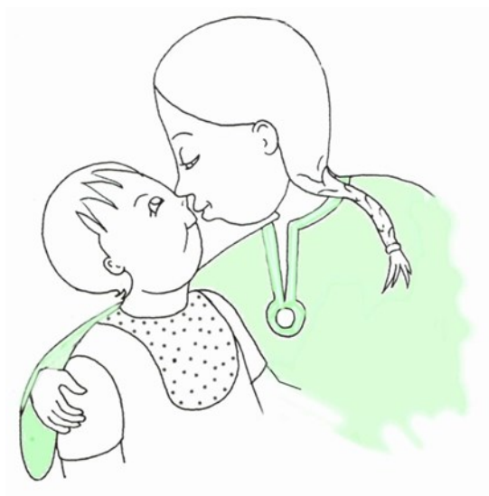
The girl is kissing a baby