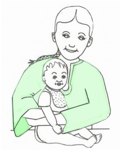
The girl is hugging a baby