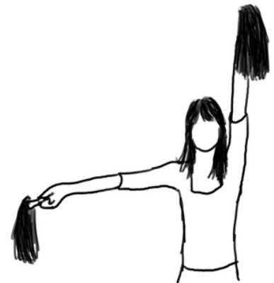
Reach one hand up and one to the side