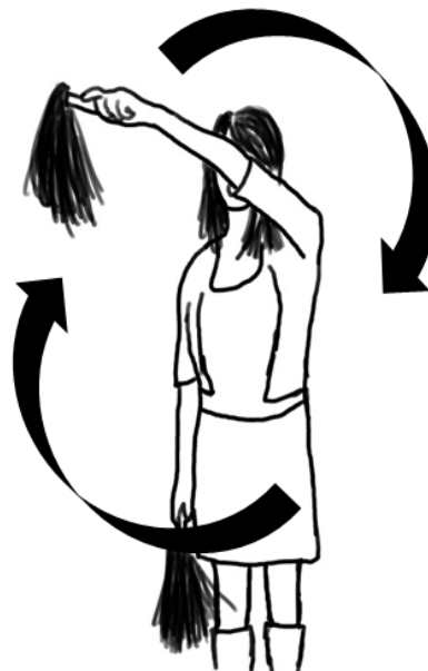
Make big circles with one or both hands

Encourage your child especially to reach up high, over his/her head with the helper hand.