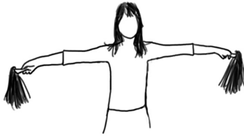
Reach out wide to each side