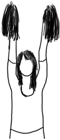
Reach up high with two hands

Here are some movements you and your child can do: