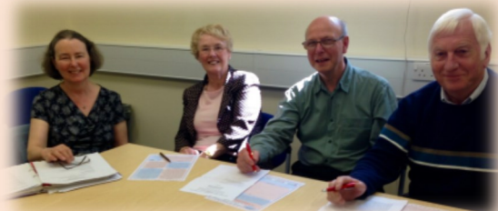
DIAMOND-Lewy PPI Group