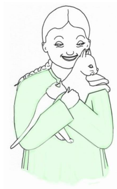
Kuri bili ki kalava mar-ni pi