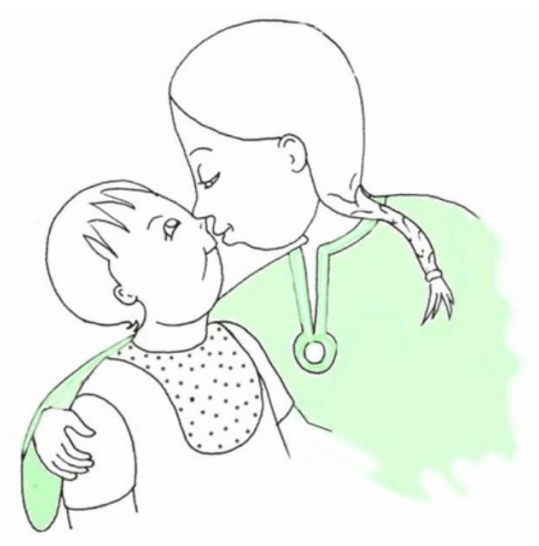
Kuri kakeh ki papi de-ni pi