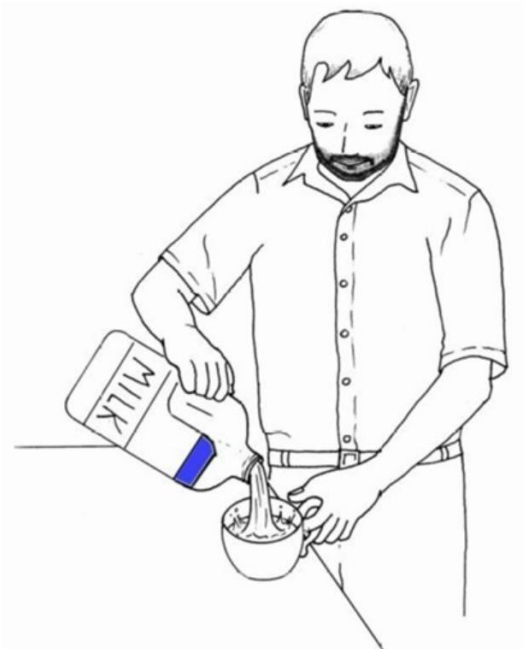
Jana dud cup-ne vich lat-na pi-ya