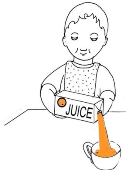
Kaka juice cup-ne vich lat-na pi-ya