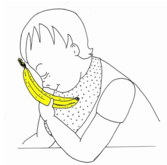
Kaka kela sing-na pi-ja