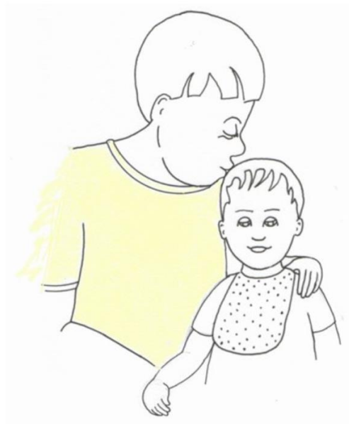
Mura kakeh ki papi de-na pi-ja