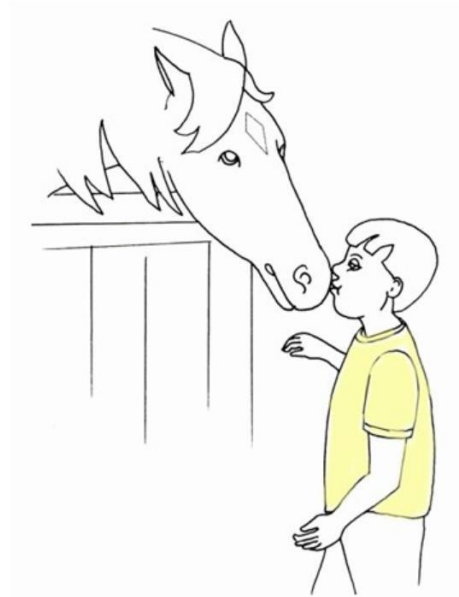
Mura khoreh ki papi de-na pi-ja