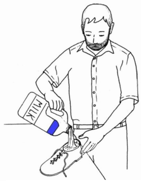
Jana dud juti-ne vich lat-na pi-ya