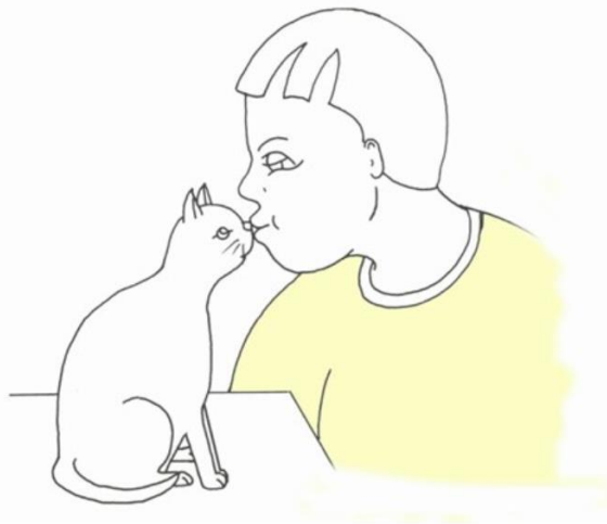
Mura bili ki papi de-na pi-ja