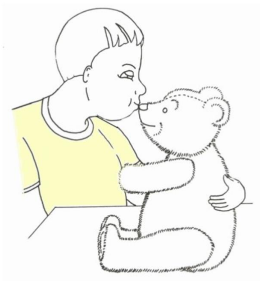
Mura gudeh ki papi de-na pi-ja