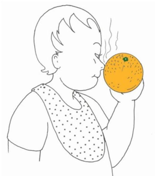
Kaka malta sing-na pi-ja