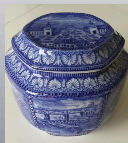
Ringtons tea caddy sold at Exhibition