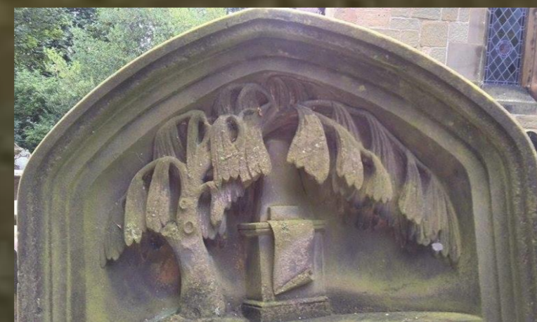
The weeping willow, symbolising mourning and mortality, popular in the 1800s.