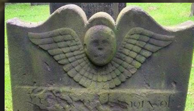
Death’s Head, most popular in the 1700s.