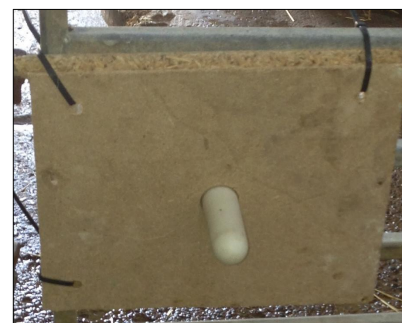
Fig. 4. The constructed dummy teat