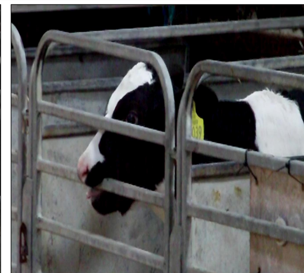
Fig. 3. Calf exhibiting stereotypical behaviour