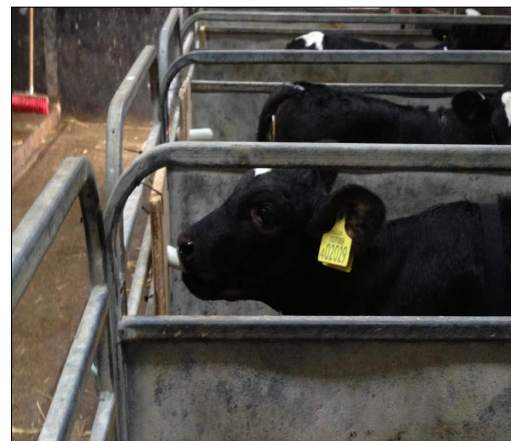
Fig.2. Calf actively sucking on teat